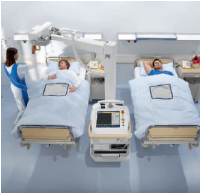
Bedside chest image acquired with a grid