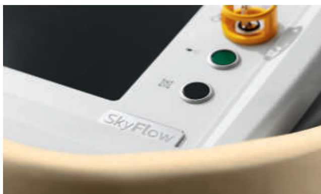
Usability Study Time Savings