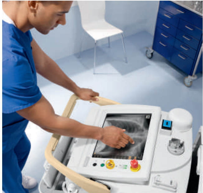
Bedside chest image acquired with SkyFlow